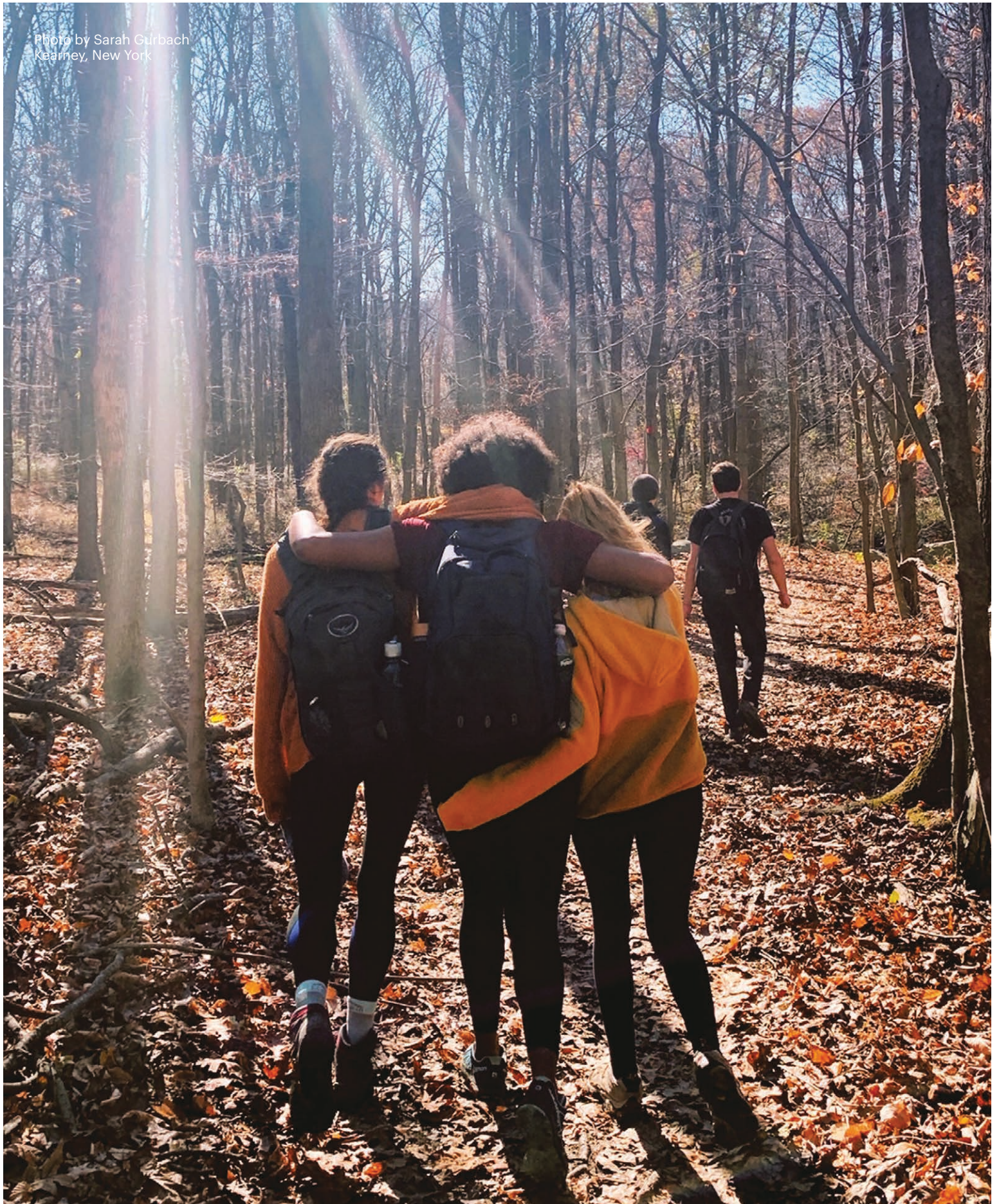
Kearney, New York

When the company just feels right. Learn more at kenarney.com